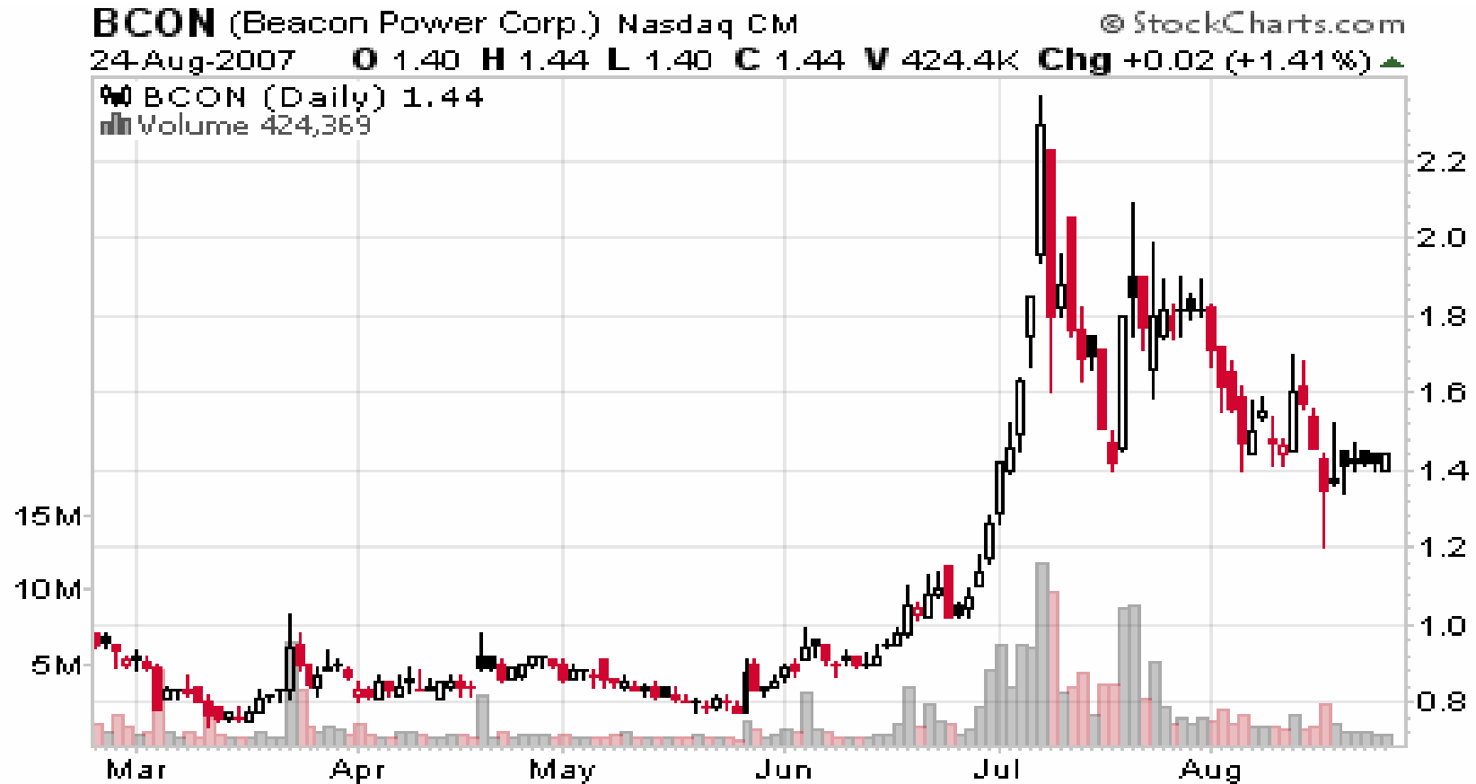
Chart courtesy of Stockcharts.com