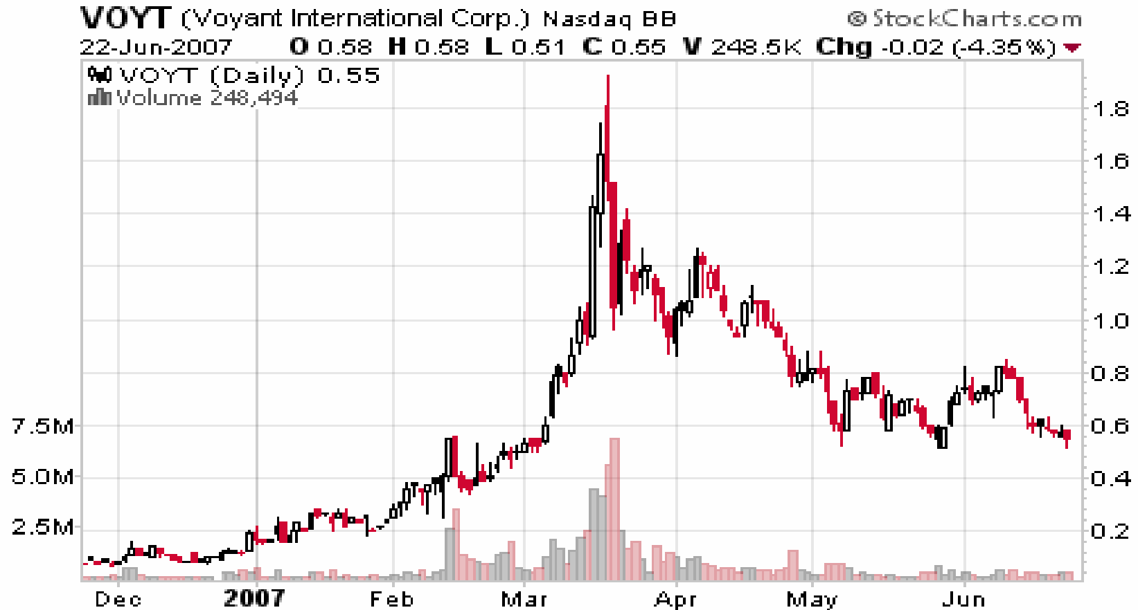
Chart courtesy of Stockcharts.com