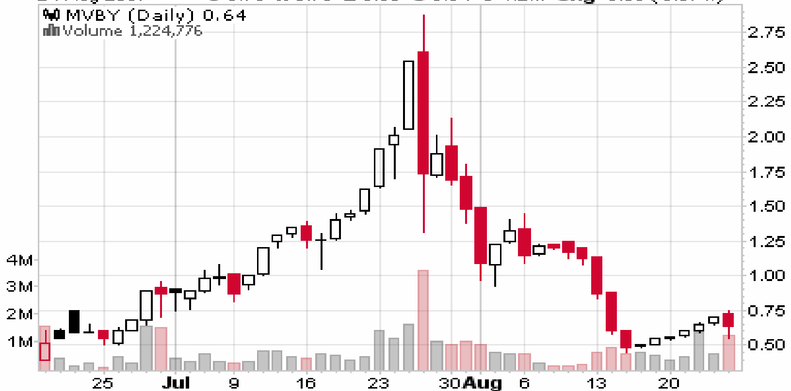
Chart courtesy of Stockcharts.com