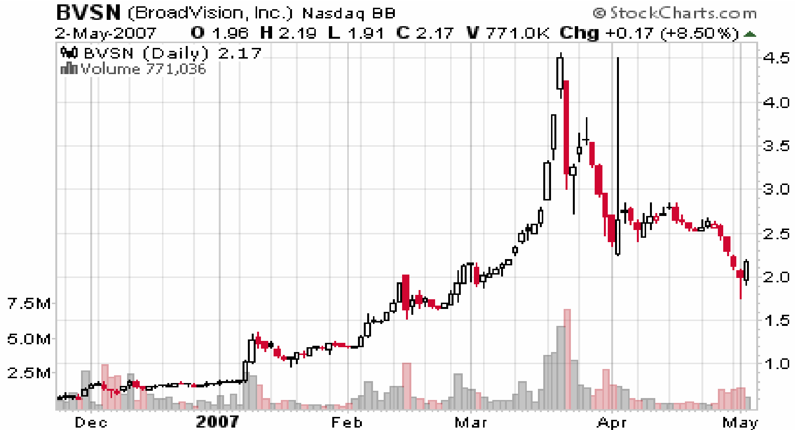
Chart courtesy of Stockcharts.com