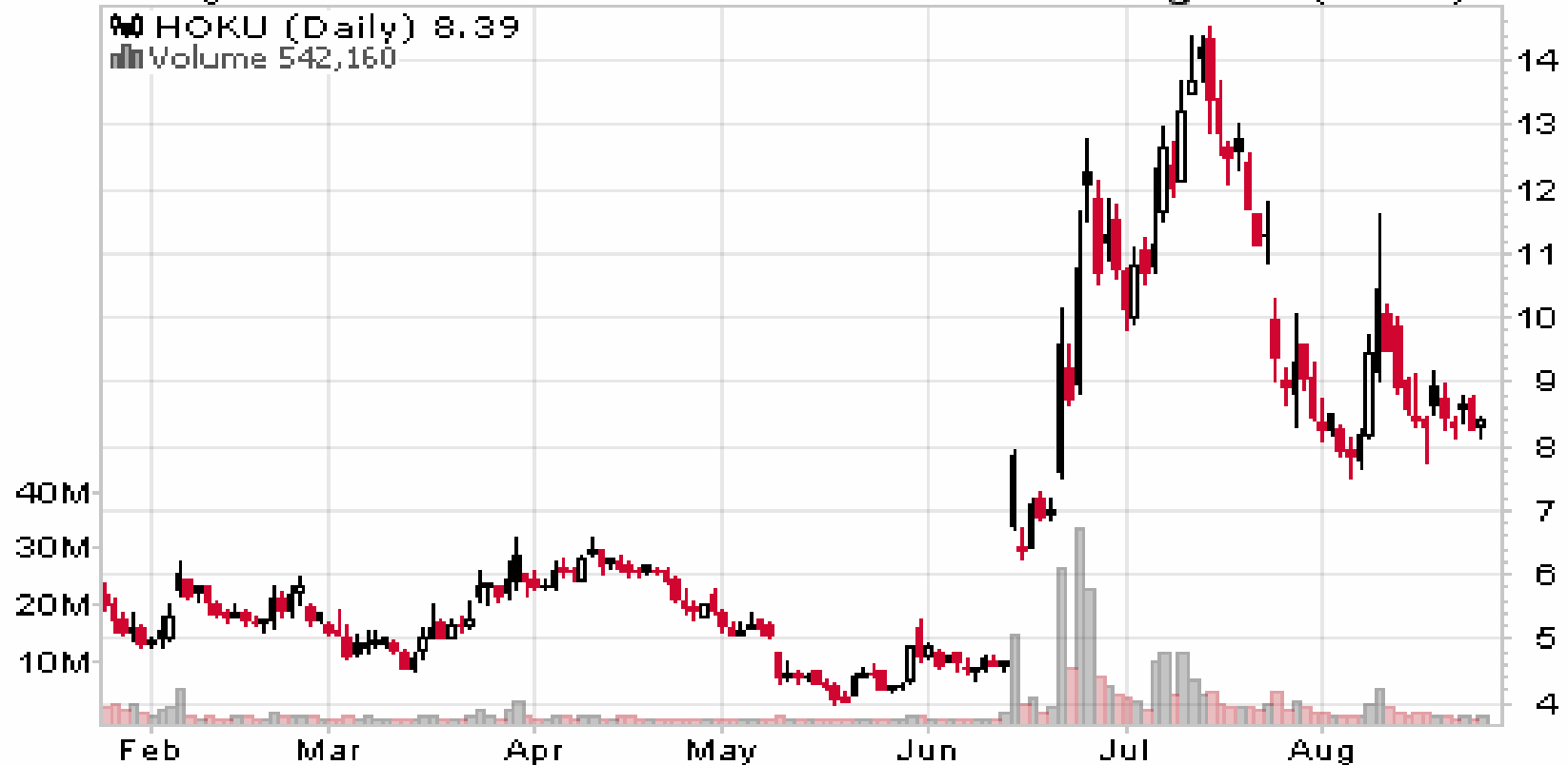
Chart courtesy of Stockcharts.com

HOKU (Hoku Scientific Inc) Nasdaq GM © StockCharts.com 24-Aug-2007 O 8.33 H 8.47 L 8.13 C 8.39 V 542.2K Chg +0.12 (+1.45%) ▲